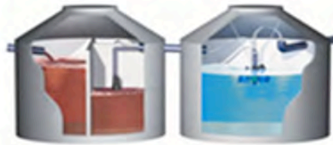
AQUAmax® PROFESSIONAL G 4 – 53 PE

For commercial applications like: restaurants, hotels, small communities, villages and holiday resorts.