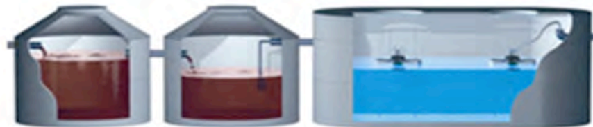
AQUAmax® PROFESSIONAL XL / XXL 60 – 2.000 PE